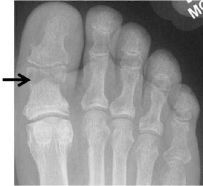
Supplemental Figure 1. Osteomyelitis of right great toe. There is cortical erosion (arrow) of the right proximal phalanx and a superimposed fracture extending laterally.