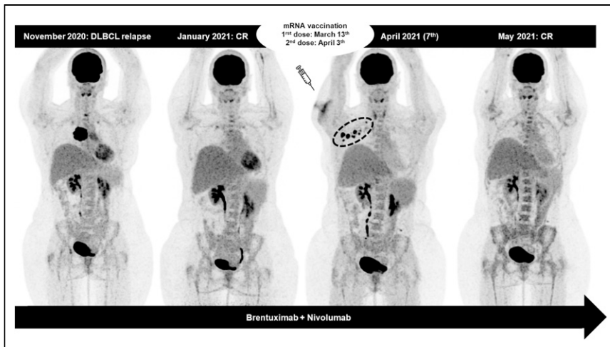
FIGURE 2. Maximum-intensity-projection ^{18}\text{F} -FDG PET images of 45-y-old woman with relapsed DLBCL in mediastinum. Patient was treated with brentuximab and nivolumab and experienced complete metabolic response 2 mo after initiation of therapy (January 2021). Although continuing lymphoma therapy, she received 2 mRNA COVID-19 vaccine injections in right deltoid. ^{18}\text{F} -FDG PET/CT scan 4 d after last vaccine dose (April 2021) showed several HLNs (encircled). On subsequent ^{18}\text{F} -FDG PET/CT scan 1 mo later, HLNs disappeared, strongly suggesting their relation to vaccination. This clinical presentation thus highlights presence of v-HLNs in patient younger than 50 y and with normal ALC at time of ^{18}\text{F} -FDG PET/CT, which was performed less than 30 d after last vaccine dose. CR = complete response; DLBCL = diffuse large B-cell lymphoma.

absence of lymphopenia (OR, 2.2; 95% CI, 1.1–4.3), and a less than 30-d interval from the last vaccine injection to the date of ^{18}\text{F} -FDG PET/CT (OR, 2.6; 95% CI, 1.3–5.6) were statistically significant factors associated with v-HLNs (Fig. 2) on univariate analysis (Table 2). All parameters remained independent predictors of the v-HLN status on multivariate analysis. Interestingly, for patients displaying lymphopenia after vaccination, we evaluated the dynamic of ALC and found that a low ALC existed before vaccination in most patients (67%, n = 36 ) suggesting that lymphopenia was not related to vaccination. The immunosuppression, the type of vaccine, and the number of doses were not associated with v-HLNs.