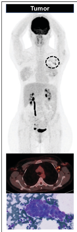
FIGURE 3. In patient with early-stage BC who received vaccine injection ipsilateral to tumor, maximum-intensity-projection ^{18}\text{F} -FDG PET image (top) shows HLN in left axilla, axial ^{18}\text{F} -FDG PET/CT image (middle) also shows left axillary HLN, and fine-needle aspiration cytology specimen shows tumor cells (May-Grünwald/Giemsa staining, \times 20 ) (bottom).

dose, and ALC) that we identified in the current study may help to guide nuclear medicine physicians in interpreting ^{18}\text{F} -FDG PET/CT images and oncologists in choosing whether to perform a biopsy. Further research is required to validate such findings and identify clinical, biologic, and imaging factors associated with the nature of HLNs (benign vs. malignant) ipsilateral to the breast tumor in a larger cohort of patients with early-stage BC.