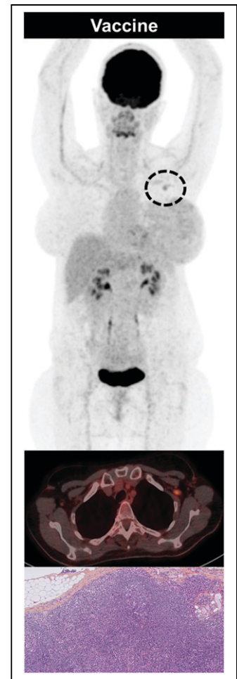
FIGURE 4. In patient with early-stage BC who received vaccine injection ipsilateral to tumor, maximum-intensity-projection ^{18}\text{F} -FDG PET image (top) shows HLN in left axilla, axial ^{18}\text{F} -FDG PET/CT image (middle) also shows left axillary HLNs, and sentinel lymph node biopsy sample shows benign reactive changes (hematoxylin-eosin-saffron staining, \times 5 ) (bottom).

No potential conflict of interest relevant to this article was reported.