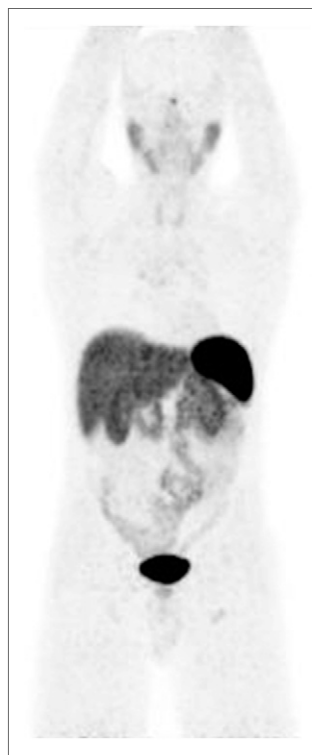
FIGURE 1. Anterior 3-dimensional maximum-intensity projection demonstrating normal, physiologic biodistribution of ^{68}\text{Ga} -DOTATATE.

^{68}\text{Ga} -labeled somatostatin analog peptides clear rapidly from the blood, with reported peak tumor uptake occurring at \pm 70 min and no radioactive metabolites detected in the serum at 4 h (Fig. 2) (14). Our data, obtained from 6 patients using ^{68}\text{Ga} -DOTATATE, demonstrate overall results similar to those using ^{68}\text{Ga} -DOTATOC, though there are no-