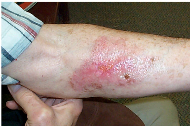
FIGURE 1. Patient forearm, on follow-up visit (about 7 wk after therapy), with radiation skin injury demonstrating moist desquamation.

(irritants) that may produce a local reaction but do not induce extensive tissue damage (3). Radiation injury can lead to severe tissue damage. Thus, we propose that leakage into tissues of radiopharmaceuticals administered in therapeutic dosages should be consistently referred to as extravasation. This terminology is consistent with the language used previously in reporting radiopharmaceutical-induced radiation injury (2,4).