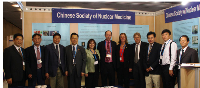
In Barcelona, Spain, in October 2009, CSNM and SNM leaders discussed plans for the conference.