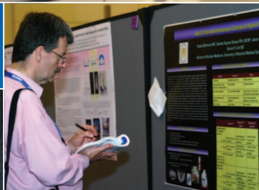
▲ Poster exhibits provided detailed information on the latest research.