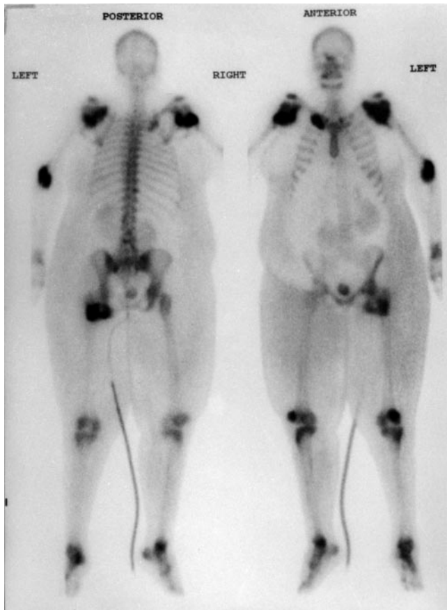
FIGURE 3. In 46-y-old quadriplegic woman, HO developed at multiple sites: both shoulders, left elbow, proximal right clavicle, and left hip. Less intense increased uptake in hands, feet, and knees is caused by arthritis.

the development of joint ankylosis or other complications of HO. Therefore, attempts have been made to stage the maturity of HO on the basis of imaging studies. Unfortunately, accurate indicators of maturity have remained difficult to obtain. Radiographic depictions of maturity, consisting of lesions with distinct margins and well-defined trabeculations, have not proved to be reliable predictors of nonrecurrence of HO after surgery (48). For several investigators (8,9,27), serial preoperative bone scans that quantify the ratio of heterotopic to normal bone activity have successfully predicted both intraoperative complications and postoperative nonrecurrence; a decreasing or stable scintigraphic activity ratio is considered the hallmark of mature HO (Appendix). As HO becomes mature, there also is a significant decrease, often reaching a normal level, in both flow study and blood-pool activity. The ideal candidate for surgical resection of HO will have no joint pain or swelling, a normal alkaline phosphatase level, and a 3-phase bone scan indicating mature HO (Table 2). As for other imaging modalities, CT has identified a low-density material in the soft tissue adjacent to areas of ectopic ossification postulated to be immature unossified connective tissue, the violation of which may be responsible for the serious intraop-