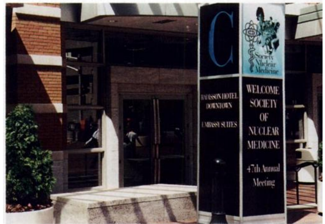
St. Louis welcomes the Society of Nuclear Medicine to the Convention Center.