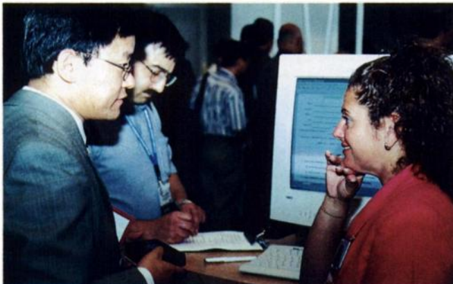
The Internet kiosks proved to be extremely popular with attendees.