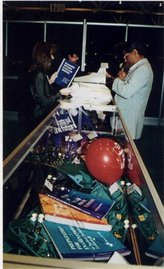
Marketplace showcases SNM products and publications.