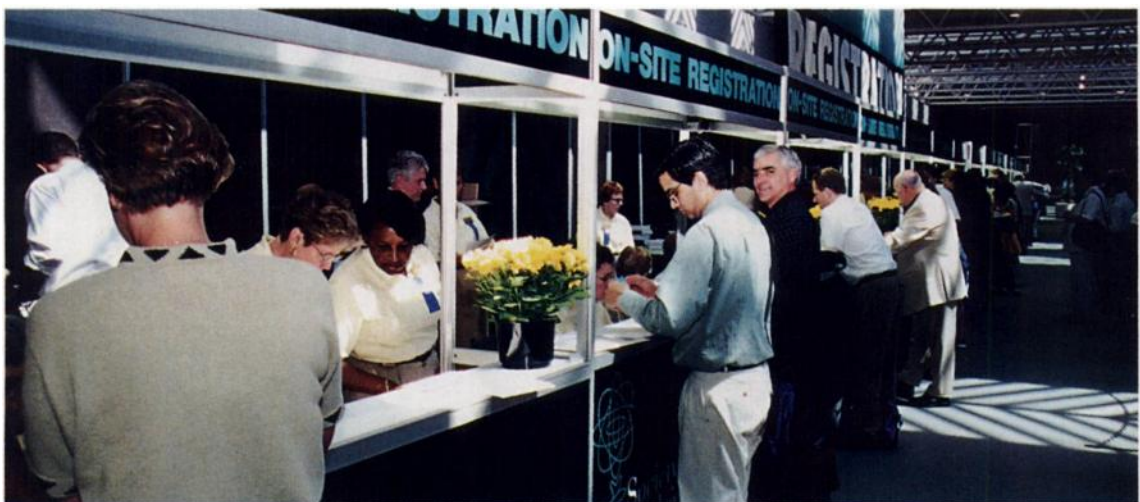
Registrants are helped in an expedient and friendly manner.