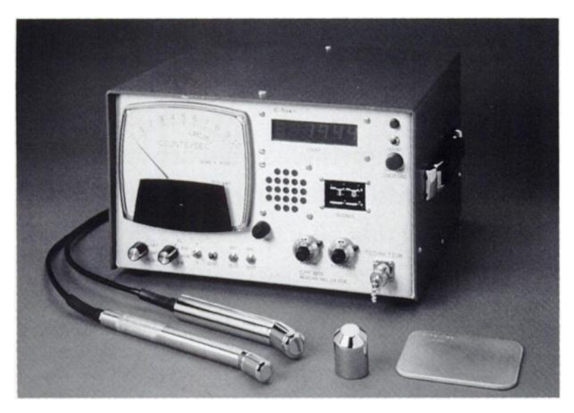
The C-Trak* Surgical Guidance System by Care Wise, Morgan Hill, CA, is designed to detect small sites of radioisotope uptake in the high-scatter, highly variable background environments found with nuclear medicine imaging radiolabels such as 111 In and 99mTC.

Institute in Amsterdam recently reported that scintigraphy combined with the use of a gamma detection probe and a blue dye mapping technique can identify almost 100% of sentinel nodes in patients with melanoma ( J Nucl Med 1997;38:362-365).