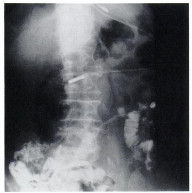
FIGURE 1. Supine abdominal x-ray demonstrating a 5-cm calcified abdominal aortic aneurysm.

marked aortic wall thickening of the anterior and lateral walls. They are considered a variant of atherosclerotic aneurysms and represent 5%-23% of all abdominal aortic aneurysms (4). They are more common in men. Dense adherence to surrounding structures occurs, most commonly involving the duodenum (79%), left renal vein (32%) and ureters (26%) (5). They are more likely to produce symptoms than ordinary atherosclerotic aneurysms. The triad of abdominal pain, weight loss and an elevated erythrocyte sedimentation rate is considered highly suggestive of an inflammatory aneurysm (5). Its etiology is unknown.