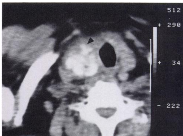
FIGURE 3. CT scan (without intravenous contrast) showing slight deviation of the trachea to the left and extensive calcification throughout the tumor.

Thyroid gland scintigraphy shows both primary extrasosseous osteosarcoma and cyst as a cold nodule. With ultrasound, the tumor is usually well margined but may show infiltration into surrounding tissues. A cyst will be well demarcated. Calcifications are easily identified in both lesions, but differentiation between the two may be possible by characterization of the echo pattern. In primary extrasosseous osteosarcoma, the tumor has a mixed echogenicity throughout, and the calcifications are compact and distributed throughout the tumor. The cyst is anechoic or hypoechoic, and the calcifications are peripheral, coarser, and more irregularly distributed. The compact pattern of calcification as seen with osteosarcoma is unusual in patients without history of a goiter.