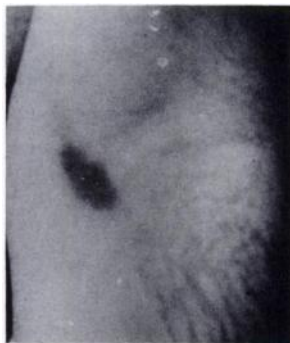
FIGURE 1 Radiation burn evident by inspection 20 days after injection.

The patient returned 13 days later (i.e., 20 days after the injection) to inquire about the tender pruritic and erythematous patch at the injection site at which time the photograph in Figure 1 was taken. At the injection site, he had an erythematous patch