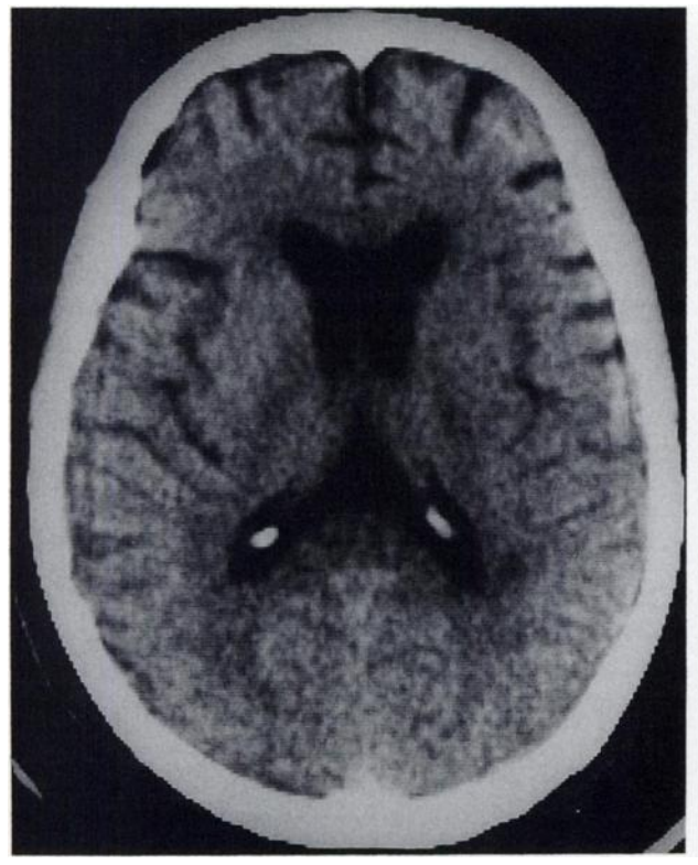
FIGURE 1 A brain CT scan showed mild cortical atrophy.