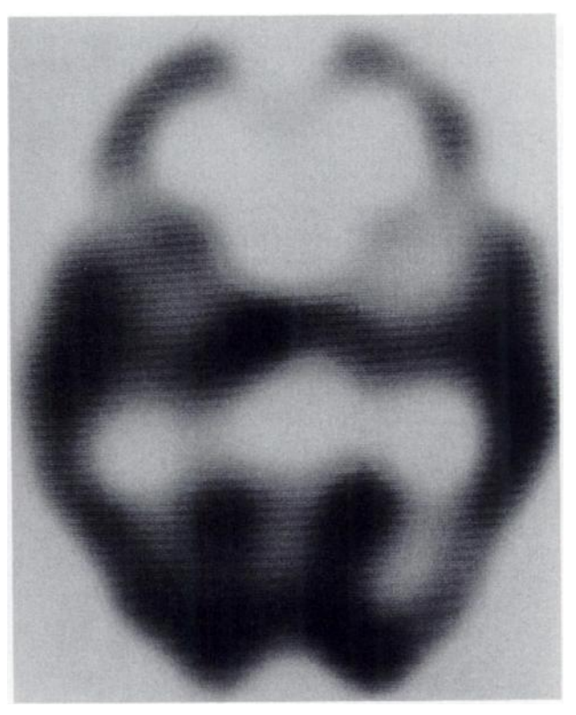
FIGURE 4 An IMP SPECT showed reduction of IMP uptake in bilateral frontal and temporal regions.

junction with the psychologic findings are suggestive of Pick's disease. The personality change experienced by these patients, however, was also mild to slight, and personal contact was preserved fairly well (1,2).