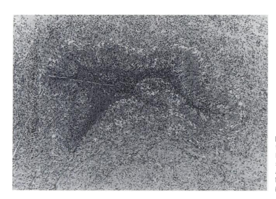
FIGURE 3 Photomicrograph (100×) of a wedge biopsy of the liver showing a typical stellate microabscess, consisting of a central zone of neutrophils and cellular debris with a surrounding rim of palisading histiocytes.

Multiple atypical cases of CSD have been described in the literature. However, CSD remains a diagnosis of exclusion due to the fact that the etiologic agent has