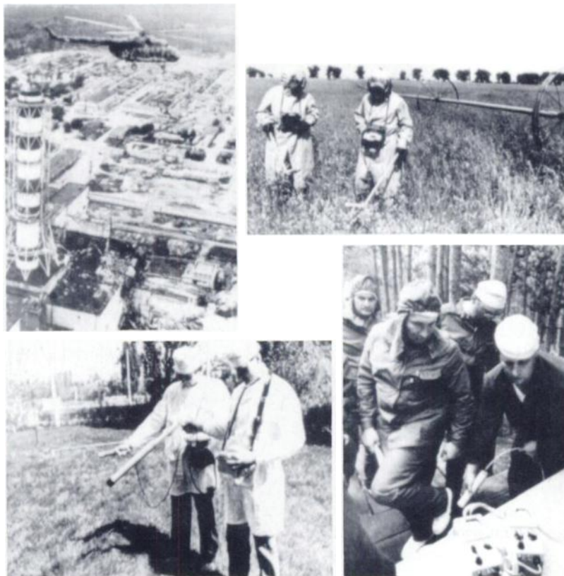
These scenes depicting responses to the Chernobyl nuclear power accident of April 1986 were part of the Soviet Union's display at the post-accident review meeting held last August at the International Atomic Energy Agency in Vienna, Austria.