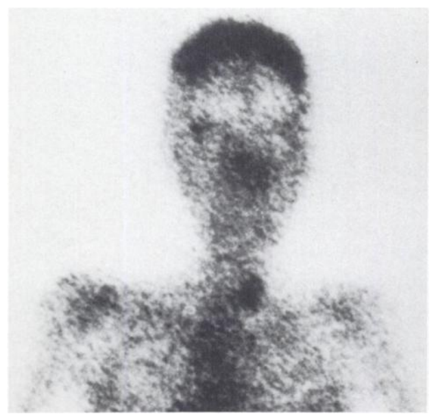
FIGURE 1 Gallium-67 scintigraphy of patient, demonstrating abnormal uptake in lower left neck

The capsule was thick, and broad fibrous trabeculae traversed the tumor. Moderately increased mitosis within the parenchymal cells and intravascular cell proliferation was observed. More than half of the left thyroid lobe was displaced by atypical cells that were indistinguishable from those in the adjacent tumor. There was no appreciable infiltration of lymphocytes in the tumor and the thyroid gland. The pathological diagnosis was parathyroid adenocarcinoma invading the thyroid gland.