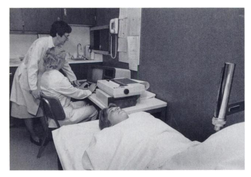
Patient undergoing dual photon absorptiometry of lumbar spine at the University of Kansas Medical Center. Sodium iodide detector (at right) picks up "44 and 100 keV" emissions from gadolinium-153 in shielded source holder positioned beneath the imaging table.

The American College of Nuclear Physicians (ACNP) has also answered the OHTA's call for input, stating that the dual photon procedure "has added an important new dimension to the diagnosis and treatment of bone loss."