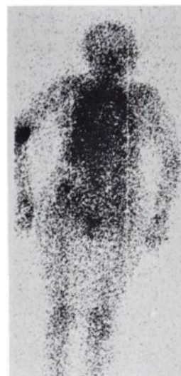
FIG. 1. Whole body gallium-67 scan with diffuse increased uptake in both lung fields. Total Gallium Index (see text) is 645.

The patient received 5 mCi of gallium-67 citrate intravenously on 3/31/80, and whole-body and rectilinear scans were performed 48 hr later. The scans showed marked, diffuse increased uptake in both lung fields. The calculated Gallium Index* (3) was 345 in the left lung and 300 in the right lung for a total Gallium Index of 645 (Fig. 1).