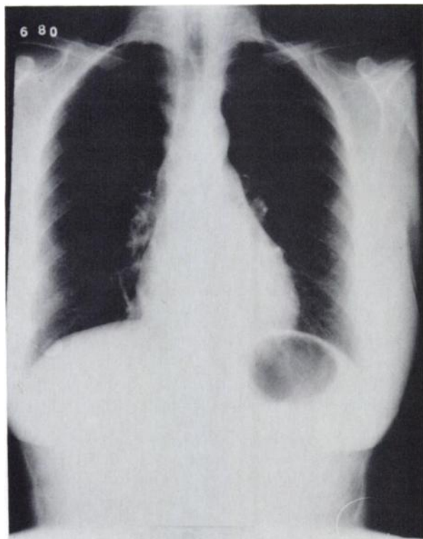
FIG. 4. Follow-up radiograph showing clearing of the lower-lobe infiltrates.

Ga-67 in vitro), or to the inflammation itself, which may increase capillary permeability allowing early influx of the radionuclide (10).