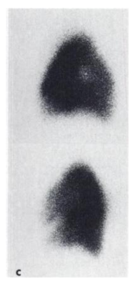
FIG. 1. Right (RL) and left (LL) lateral views of perfusion lung scintigrams of Patient 1. For discussion see text. (A) May 22, 1975: perfusion is absent from middle lobe and anterior segment of lower lobe, right; from lingulae; and from anterior and posterior segments of lower lobe, left. (B) Jan. 28, 1977: no perfusion defect present on lateral views. (C) March 13, 1979: perfusion is absent from anterior segment of lower lobe, right, and from inferior lingula and anterior and posterior segments of lower lobe, left.

of acute chest pain. Her left leg was swollen and painful. The chest radiograph was normal. The perfusion lung scan showed no perfusion in the anterior segment of the right upper lobe and in the anterior and posterior segments of the right lower lobe. The inferior lingula and the post segment of the lower lobe on the left were also not perfused. (For the defects seen on the lateral views see Fig. 1C.) A few days later the chest pain was gone, as were the pain and swelling of the leg.