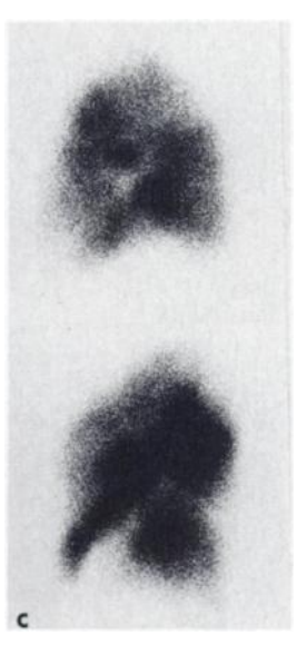
FIG. 2. Right (RL) and left (LL) lateral views of perfusion lung scan of Patient 2. For discussion see text. (A) March 29, 1976, (B) April 9, 1976; (C) March 13, 1979.