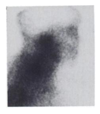
FIG. 1. Posterior and lateral views of cervical spinal column. Positive Ga-67 scan of disk-space infection at C-7 was proved by open biopsy. This 62-year-old woman presented with malaise, loss of weight, and severe neck pain. Clinically, myeloma was considered, but radiographically there was suspicion of infection.