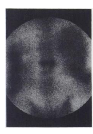
FIG. 2. A 57-year-old woman with systemic lupus erythematosus, who had severe back pain while receiving steroid therapy. Radiograph of lumbar spine. Changes were considered secondary to hypercortisonism. Posterior Ga-67 scan of lumbar spine with positive uptake in T-12 interspace. This finding directed clinicians to staphylococcal infection of disk space.

positive disk-space aspiration or open biopsy. In three of the 17 patients with positive gallium scans, the findings on the initial radiographs and the test results were normal, but the positive gallium scan directed the clinicians to the site of active infection (Figs. 1 and 2). In four others, the gallium scan was instrumental in establishing the diagnosis, even though other evidence supported disk-space infection. Of the two patients with falsenegative gallium scans, one (who had been receiving antibiotics intermittently for several years) had chronic osteomyelitis in an anterior cervical fusion site, and the other had diabetes with a disk-space infection involving the lumbosacral interspace.