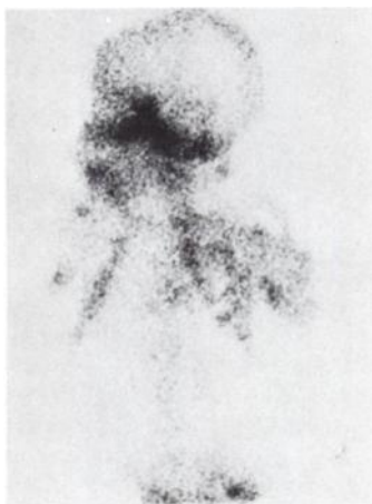
FIG. 2. Anterior scintiphoto with Tc-99m pyrophosphate 4 hr following injection. Extensive uptake in soft tissues masks normal skeletal uptake.

sive calcifications in the subcutaneous fat of the trunk and extremities (Fig. 1). A scintigram was made 4 hr after i.v. administration of 2.7 mCi of Tc-99m pyrophosphate. It showed extensive uptake in the soft tissues (Fig. 2).