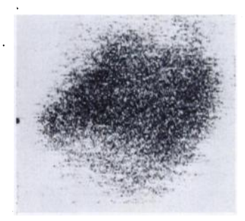
FIG. 1. Anterior abdominal rectilinear scan in Case 1, obtained 24 hr after i.v. administration of Ga-67 citrate. Negative defect to viewer's left (upper) corresponds to hepatic area. Peritoneal cavity is outlined by radiotracer.

Case 2. A 54-year-old woman was admitted because of three attacks of right upper quadrant pain, not apparently related to meals. Past history was noncontributory. Temperature was 37°C, pulse 80, respirations 20, and blood pressure 150/80. There were no pertinent physical findings. The hematocrit was 41, white blood cell count 5,400 with a normal differential. An oral cholecystogram did not visualize the gallbladder. At surgery, cholecystectomy, removal of a common-duct stone, and a cholangiogram were performed. The surgically removed gallbladder was reported as showing cholecystitis and cholesterolosis. Postoperatively