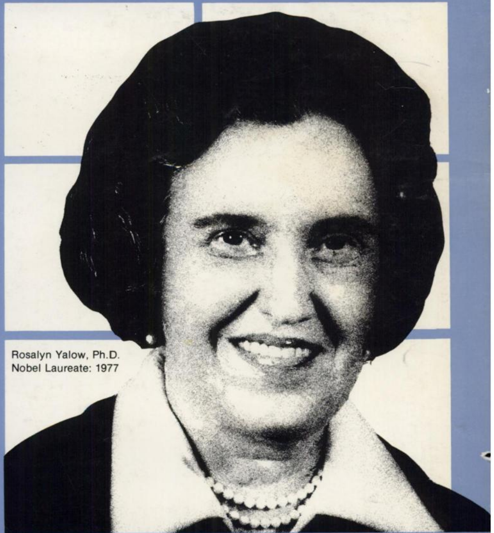
Rosalyn Yalow, Ph.D. Nobel Laureate: 1977