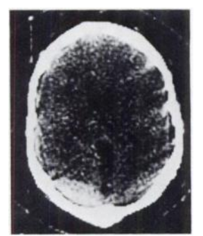
FIG. 2. Cranial computed tomography depicting left occipitoparietal extradural hematoma.

shaped area of increased density consistent with acutely extravasated blood in the left occipitoparietal region. The appearance was typical of an extradural hematoma. Retrograde right brachial, direct left carotid, and direct left brachial arteriograms were normal. A craniotomy performed the following day revealed a 40-cc left occipitoparietal subacute extradural hematoma. A review of the literature failed to uncover any previous report of extradural hemorrhage that produced a focal defect on the nuclear angiogram (4-12).