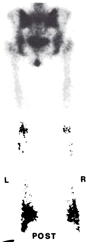
FIG. 2. Posterior view of ^{99m}\text{Tc} -pyrophosphate scan reveals diffusely increased bilateral tracer localization in areas of myxedema.

The third distinguishing scintigraphic feature observed in this patient is the diffuse uptake of the