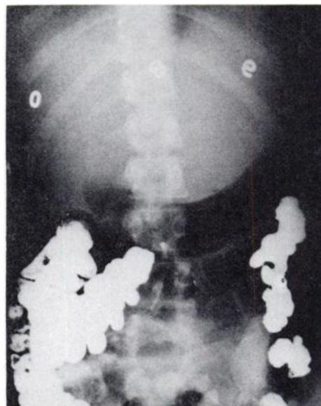
FIG. 2. Abdominal radiograph recording enlarged lobe of liver producing extrinsic pressure on lesser curvature of stomach.

Approximately 2–3 months prior to admission she noticed a slight weight gain which she described as being centered over the epigastrium. One week prior to admission she developed pressing pain in the epigastric area that radiated to her back and left shoulder. She had a palpable mass in the epigastrium that was described as being firm and mildly tender. An upper GI series recorded a large mass in the left lobe of the liver producing compression on the lesser curvature of the stomach; ^{99\text{m}}\text{Tc} -sulfur colloid liver scan recorded a large space-occupying lesion in the left lobe of the liver (Figs. 1 and 2). A gallium liver scan was then performed and the large mass lesion of the left liver lobe demonstrated increased uptake of gallium as compared with adjacent