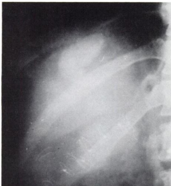
FIG. 2. Oral cholecystogram demonstrating ectopic position of gallbladder. Note superior and medial direction of fundus.

intrahepatic gallbladder specifically by McNamee (8). The most common abnormal locations are the left lobe intrahepatic, transverse, retroplaced, or "floating" gallbladders. Less frequent locations have been reported in the falciform ligament (9), in the anterior abdominal wall (10), and between the superior surface of the liver and the anterior chest wall (11). Intrahepatic localization is the second most frequent anomaly of location (7).