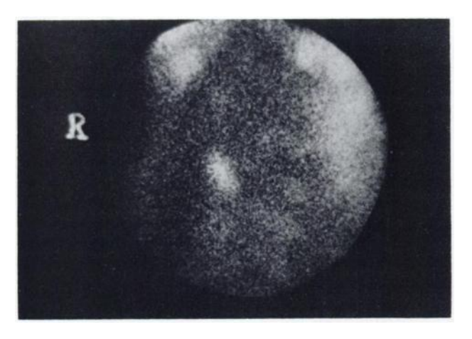
FIG. 2. Gamma camera view of ribs with breast prosthesis removed showing abnormal uptake in rib.

shoulder in March 1973 showed changes consistent with a metastatic lesion in the left scapula. A total skeletal scan was ordered prior to a decision about her subsequent management.