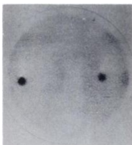
FIG. 2. Repeat imaging following placement of patient on nasogastric suction shows normal scan.

Received Nov. 3, 1973; original accepted Nov. 30, 1973.