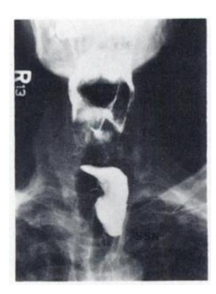
FIG. 2. Barium swallow examination demonstrating accumulation of barium in pyriform sinuses and cervical esophagus. This corresponds to three areas of abnormal <sup>131</sup> accumulation seen in Fig. 1A.

tration in the region of the thyroid bed. A 1:1 image of the neck and mediastinal area was then obtained and is shown in Fig. 1A. This image revealed two areas of abnormal tracer activity just above the thyroid cartilage and one area of abnormal tracer above the suprasternal notch. These were thought to represent areas of recurrent neoplasm. Because of the prior history of pulmonary metastases, the patient was returned to the nuclear medicine division approximately 1 hr later for 1:1 scan images of his chest. At this time the suprasternal concentration of abnormal tracer activity was no longer visible and a repeat 1:1 image of the neck and mediastinal area produced the image seen in Fig. 1B showing only faint evidence of tracer concentration in the aforementioned regions. Technical imaging factors were checked and were not varied. A 1:1 scan image 24 hr after this study confirmed the absence of significant tracer concentration in the areas previously described. An esophagram ("barium swallow") examination revealed accumulations of barium in both pyriform sinuses and in the cervical esophagus which