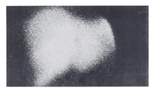
FIG. 2. Anterior liver scan showing defect in dome due to pendulous breast.

mastectomy 20 months previously for carcinoma of the breast and was being treated with chemotherapy for bone metastases. The scintiphoto (Fig. 1A) showed a distinct filling defect in the right lobe. The technician noticed that the patient was wearing a prosthetic breast. After this was removed, the scan appeared normal (Fig. 1B).