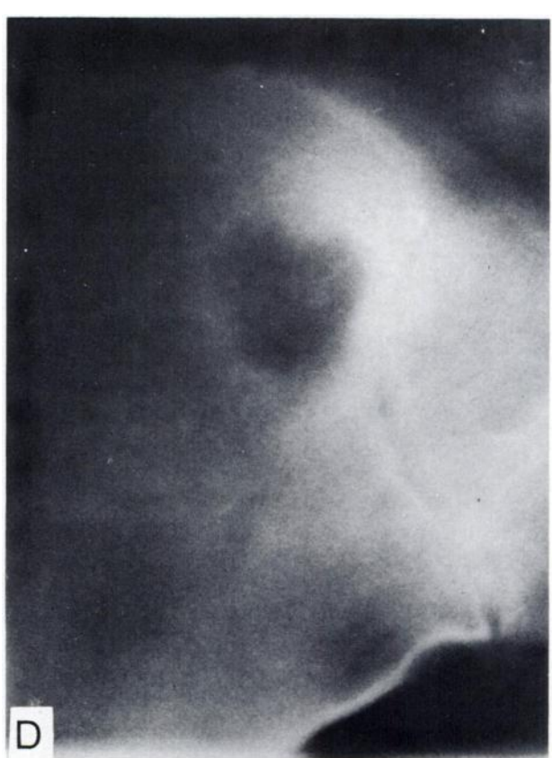
FIG. 1. Thirty-five-year-old female patient studied to exclude breast metastases to bone. A is <sup>85</sup>Sr scan of pelvis showing increased activity in right sacroiliac area. B is x-ray showing large-bowel shadow in same region. C is <sup>85</sup>Sr rescan several days later; activity in right sacroiliac area remains unchanged. D is pelvic tomagraph showing lytic lesion in right ilium.