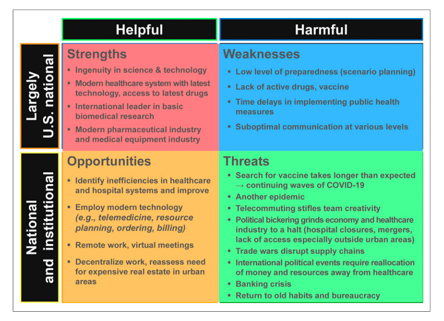
FIGURE 4. Modified analysis of SWOT for overall and health-care economic recovery in United States. *SWOT = strengths, weaknesses, opportunities, and threats.

ingenuity in drug design and vaccine development. In the clinical arena, it has already forced the rapid introduction of telemedicine at all levels of the health-care system. If implemented properly, the latter clearly can translate into considerable time savings for patients and physicians. It will be important to maintain this spirit of innovation throughout the U.S. health-care system.