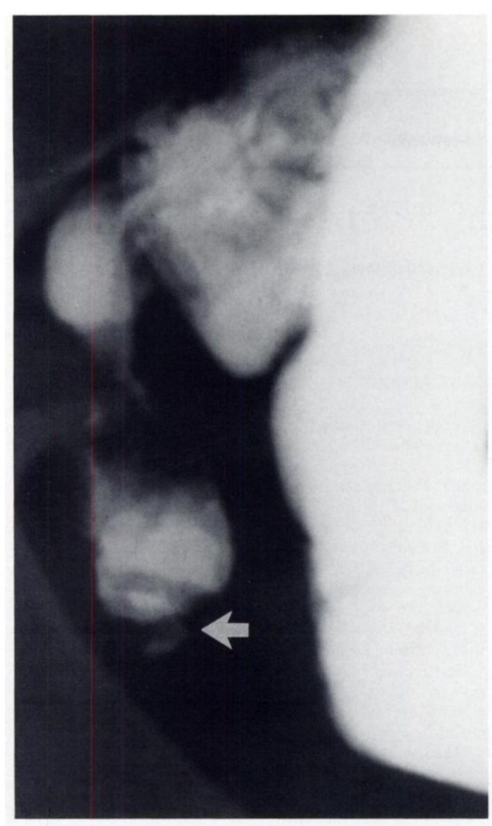
FIGURE 2. Spot film from small bowel series confirms presence of Meckel's diverticulum and shows ulceration (arrow) at its tip.

episode of bloody diarrhea. Evaluation by her primary physician revealed a normochromic, normocytic anemia with a hematocrit of 21. She promptly recovered from this episode and regained her strength. Her hematocrit returned to normal and a follow-up occult blood screen of her stool was negative. After passing a maroon stool and experiencing a syncopal episode at 18 yr, her evaluation again revealed a normocytic, normochromic anemia with a hematocrit of 27. Before referral to our institution, this patient had undergone upper endoscopy, colonoscopy and an upper GI series, which did not demonstrate a bleeding source. Technetium-99mpertechnetate scintigraphy was performed due to suspicion that a Meckel's diverticulum with ectopic gastric mucosa was the cause of the bleeding. Planar images revealed a possible site of abnormal tracer localization overlying the iliac vessels in the right lower quadrant (Fig. 1A). Focal tracer localization that was clearly separate from vascular structures and was of qualitatively equal intensity to that observed in the stomach was demonstrated with SPECT (Fig. 1B). A small bowel follow-through, with fluoroscopy directed by the results of scintigraphy, showed a diverticulum with an ulceration at its distal aspect arising from the ileum (Fig. 2). A Meckel's diverticulum was surgically excised from the ileum at its site of origin approximately 2 ft proximal to the cecum. The