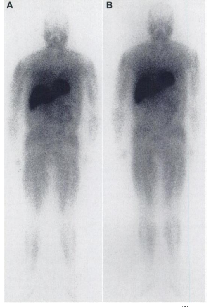
FIGURE 1. Whole-body images (anterior view) obtained with ^{123} I-3(R)-BMIPP (A) and 2 days later with ^{123} I-3(S)-BMIPP (B). Images were acquired 20 min postinjection.

Whole-body images obtained in a Patient 20 min postinjection are shown in Figure 1. Early and late images show similar distribution with 3(R)-BMIPP and with 3(S)-BMIPP. The percentage of total-body uptake in the heart and in the liver are given in Table 2.