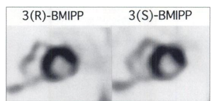
FIGURE 3. Midventricular short-axis slices obtained with <sup>123</sup>I-3(R)-BMIPP (left panel) and 2 days later with <sup>123</sup>I-3(S)-BMIPP (right panel) in a patient with inferior myocardial infarction. Images were acquired 60 min postinjection.

dium would improve the quality of cardiac imaging and reduce the radiation exposure to patients and costs.