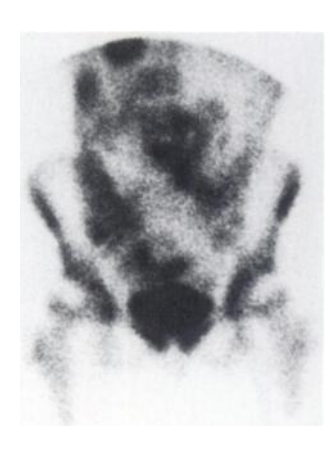
FIGURE 3. This patient, originally thought to have ulcerative colitis, had a scan that revealed small bowel uptake indicative of Crohn's disease.

have been used successfully to image a wide variety of inflammatory diseases (9,11-18). Intra-abdominal infections have been detected as early as 0.5 hr postinjection (10,11).