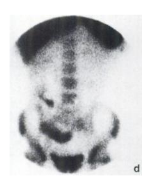
FIGURE 2. Four different Crohn's disease patients with discontinuous uptake. (A) Grade 3 uptake is noted in the descending and transverse colon, whereas the ascending colon reveals discontinuous uptake. (B) Discontinuous Grade 3 uptake in a portion of the ascending colon and terminal ileum. The lack of uptake in a continuous fashion beginning in the rectum clearly militates against ulcerative colitis. (C) Skip area in the descending-transverse colon suggests Crohn's disease. (D) Discontinuous uptake in the ascending colon and terminal ileum.