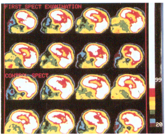
FIGURE 2. First two rows: <sup>99m</sup>Tc-HMPAO SPECT of the brain on Day 4, performed during exacerbation of the symptomatology. Sagittal slices are depicted progressing from right to left, with the nose oriented towards the left side of the picture. This SPECT examination shows a bifrontoparietal defect, larger on the right. Last two rows: control <sup>99m</sup>Tc-HMPAO SPECT of the brain on Day 19 after disappearance of echolalia and palilalia. The bifrontoparietal defect is now small when compared with the first examination

In the patient presented, SPECT was performed because of a normal CT scan and MRI in the presence of major acute neuropsychological changes. SPECT demonstrated a large bifrontoparietal defect. Because of the size and the confirmation of the defect by repeat SPECT, an accidental