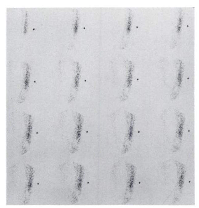
FIGURE 1 Dynamic study (3 sec/frame for 48 sec) of both lower extremities showing increased blood flow to the right ankle. (The study was performed posteriorly with the marker indicating the patient's right side.)

moniae osteomyelitis involving long bones since 1950 and only two since the mid-1960s (1). Since 1973 there have been seven reported cases of Klebsiella osteomyelitis occurring in i.v. drug abusers, but these have all involved vertebral bodies rather than long bones (5,6).