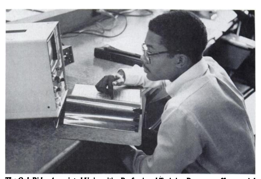
The Oak Ridge Associated Universities Professional Training Programs offers special courses to science students and faculty that allow hands-on experience with equipment—such as high-purity germanium detectors for gamma spectroscopy and surface barrier detectors for alpha and beta spectroscopy—not available on most college campuses.