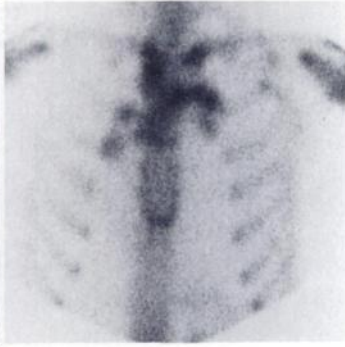
FIG. 2. Metastases to mediastinal nodes in 18-yr-old man. PA and lateral chest radiographs demonstrate hilar and mediastinal adenopathy in spite of previous extensive surgery. Anterior bone scintigram shows abnormal tracer accumulation in mediastinal nodes.

on both radionuclide and radiographic examinations in all patients. In one patient, however, a right orbital lesion detected by bone study was not detectable on radiographs of the skull and sinuses, although another lesion in the same patient was present on both examinations.