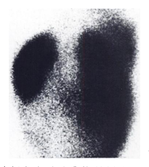
FIG. 1. Anterior view showing Tc-99m-labeled microspheres in spleen, right kidney, and in a large diffuse left abdominal area. Tracer was injected in right arm.

Subsequent scintiphotos centered first on the thorax, then on the abdomen, were performed. A thoracic picture realized at 1 min,