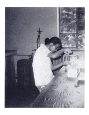
FIG. 3. In vitro radioisotope laboratory.

discipline and still belongs to basic medicine. Although there are some 1000 doctors in this field already, a society of nuclear medicine has not yet been founded, and the scientific activities are carried out under a branch of the Atomic Energy Technique Association.