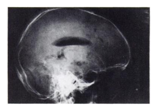
FIG. 1. Lateral projection of skull showing pneumocephalus.