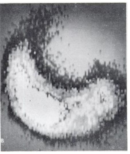
FIG. 1. (A) Anterior view of right knee following intra-articular administration of <sup>198</sup>Au-colloid. (B) Lateral view.