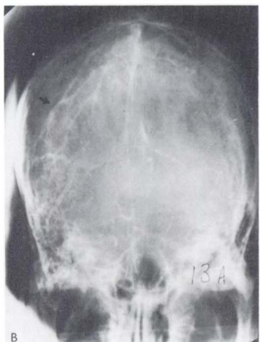
FIG. 2. (A) Extravasation (short straight arrow) from branch of middle meningeal artery (curved arrow). (B) Avascular epidural hematoma compressing brain (arrow).

a proven epidural hematoma. Of 18 cases of epidural hematoma where scintigraphy was performed, found in a literature review (1,3-11), all had an area of increased uptake in the familiar peripheral crescentric configuration identical to that of subdural hematoma. The mechanism of this increased uptake is believed to relate to accumulation of the radiopharmaceutical in the membranes of the hematoma (10), although two epidural hematomas were seen by scintigraphy as early as two days after head trauma (5).