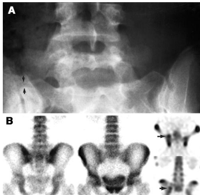
FIGURE 1. (A) Transitional vertebra is shown on radiograph of 17-y-old girl with 7-mo history of progressive low-back pain that was exacerbated with hyperextension. Sclerosis is not evident along articulation of right transverse process with sacrum, which is denoted by arrows. (B) No focal uptake abnormality is demonstrated by posterior (left) and anterior (middle) planar images from skeletal scintigraphy, but SPECT (axial [top right] and coronal [bottom right] images) shows high uptake at transverse-sacral articulation (arrows).

High uptake was present at the articulation between the transverse process of the lumbosacral transitional vertebra and the sacrum (Figs. 1–3) in 39 (81%) of the 48 patients. In 30 (63%) of the 48 patients, this was the only uptake abnormality. In 23 (59%) of the 39 patients with high uptake at the transverse-sacral articulation, the abnormality was shown only by SPECT (Fig. 1). For 13 (81%) of the 16 patients with high uptake by planar imaging, the finding was shown better or only by the anterior projection (Fig. 2). The uptake abnormalities were unilateral in all but one patient, who was the only one with bilateral transverse-sacral articulations shown by radiographs. In 9 (23%) of the 39 patients with high uptake at the transverse-sacral articulation, a lumbosacral transitional vertebra had not been noted in a radiographic report before skeletal scintigraphy and was identified through reevaluation of radiographs after skeletal scintigraphy.