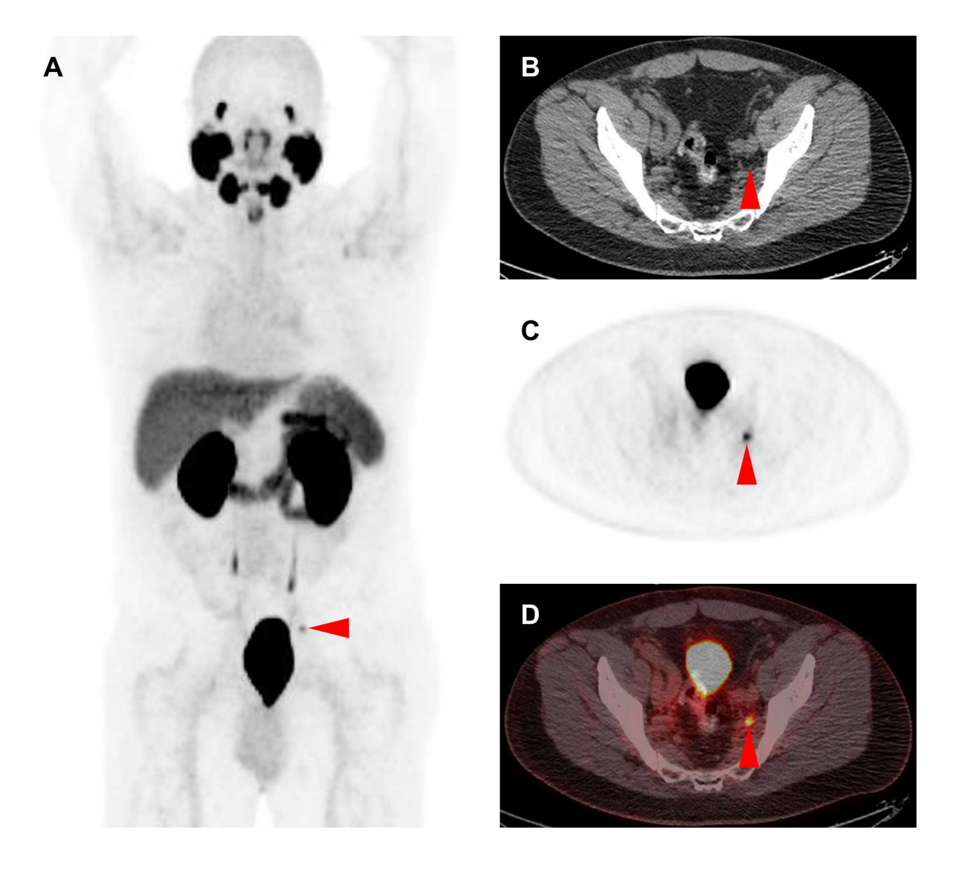
Figure 2. Pelvic lymph node recurrence detected on <sup>18</sup>F-DCFPyL PET/CT in a patient with a PSA level of 0.5 ng/mL. (A) Maximum intensity projection (B) axial, attenuation-correction CT, (C) axial <sup>18</sup>F-DCFPyL PET, and (D) axial <sup>18</sup>F-DCFPyL PET/CT images demonstrating positive uptake in a small left pelvic lymph node (SUV<sub>max</sub> 4.3, red arrowheads).