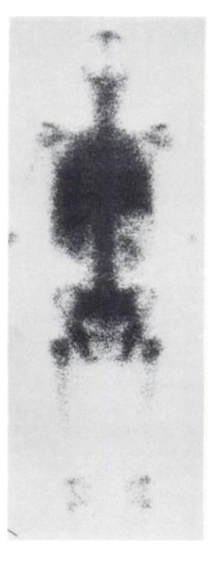
FIG. 2. Anterior view of bone scan. Note normal uptake throughout skeleton and dense uptake throughout lungs and stomach.

count was 16,900 with a marked shift to the left. The urine contained a trace of albumin. The bloodurea nitrogen was 83 mg/100 ml and the creatinine was 2.3 mg/100 ml. The serum calcium was 16.8 mg/100 ml and the serum phosphorus 5.3 mg/100 ml. The serum uric acid was 17 mg/100 ml. The serum proteins and electrophoretic pattern were normal. The alkaline phosphatase was 28 I.U. (normal 4-17).